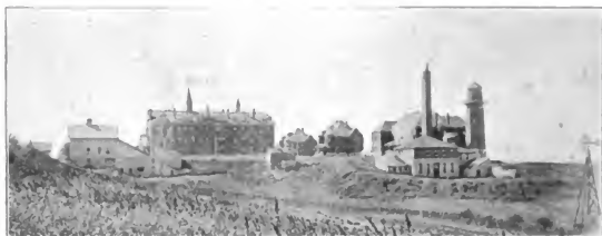
STATE ORPHANS' HOME.

State Orphans' Home. —In the first few years following the Civil war, several of the northern states founded asylums for the care of children left fatherless by the soldiers who died on the field of battle or sacrificed their health in defense of their country. In 1885 the legislature of Kansas passed an act authorizing the trustees of the state charitable insti-